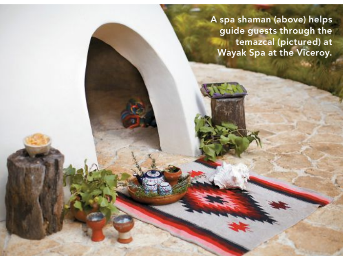
A spa shaman (above) helps guide guests through the temazcal (pictured) at Wayak Spa at the Viceroy.