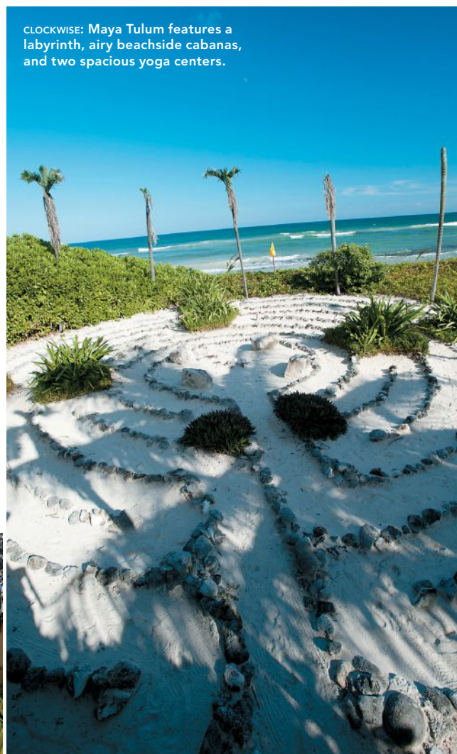
CLOCKWISE: Maya Tulum features a labyrinth, airy beachside cabanas, and two spacious yoga centers.