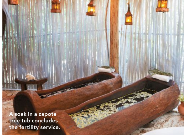
A soak in a zapote tree tub concludes the fertility service.