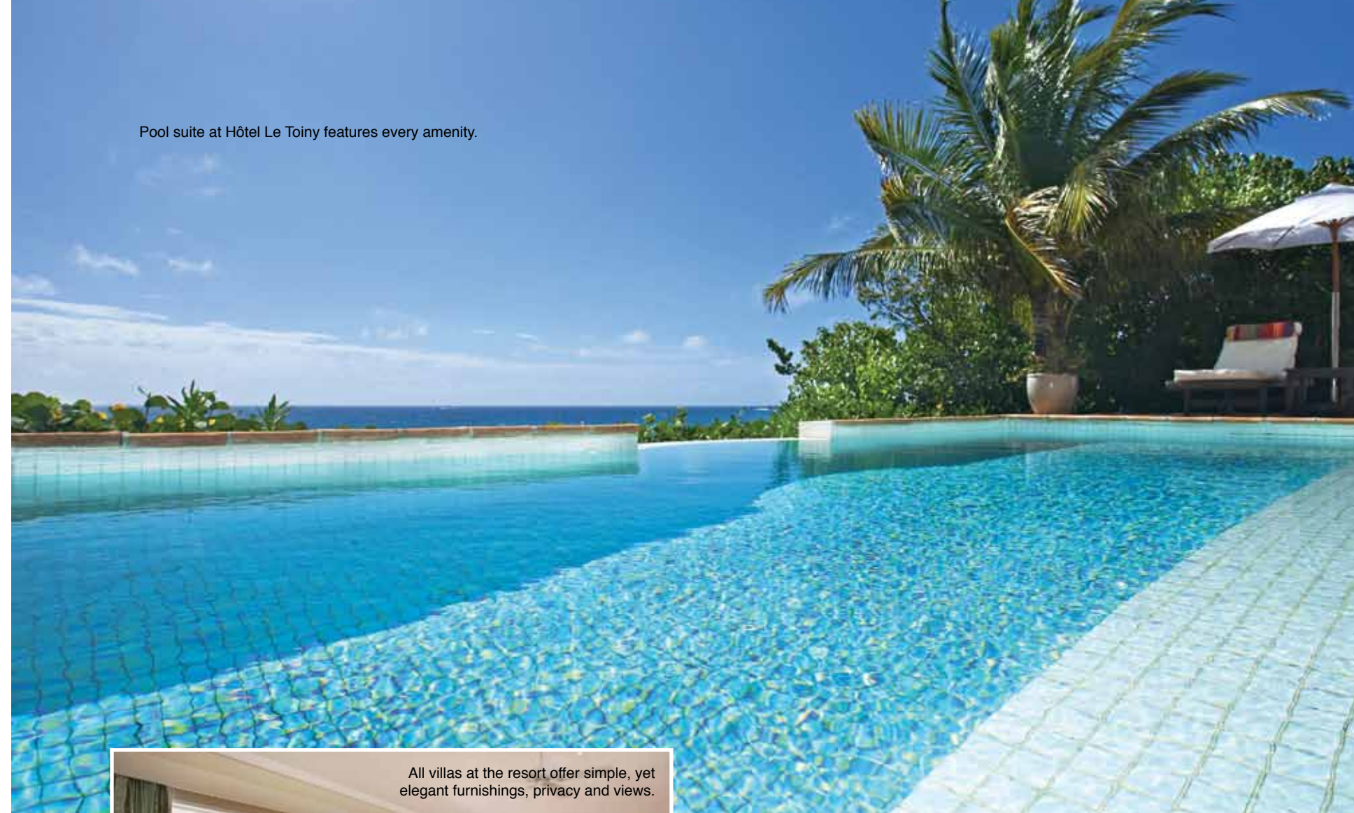
Pool suite at Hôtel Le Toiny features every amenity.

Gustavia, picturesque duty-free capital city surrounding the main harbor, is filled with fabulous shops, designer boutiques and