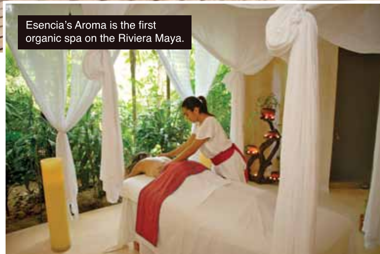
Esencia's Aroma is the first organic spa on the Riviera Maya.

spices to tropical fruits, vegetables and produce, many of the ingredients are harvested daily from the resort's gardens to compliment the top-quality seafood, meats and exotic ingredients from around the globe. The chef can also prepare dishes to your specifications. Informal dining is found at the Poolside Pavilion where the duchess traditionally enjoyed her morning coffee while watching life along the beachfront waken with the sunrise.