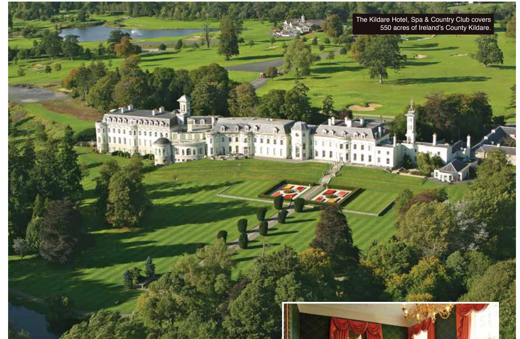
The Kildare Hotel, Spa & Country Club covers 550 acres of Ireland's County Kildare.

Romantic sunset at Esencia on the Riviera Maya.