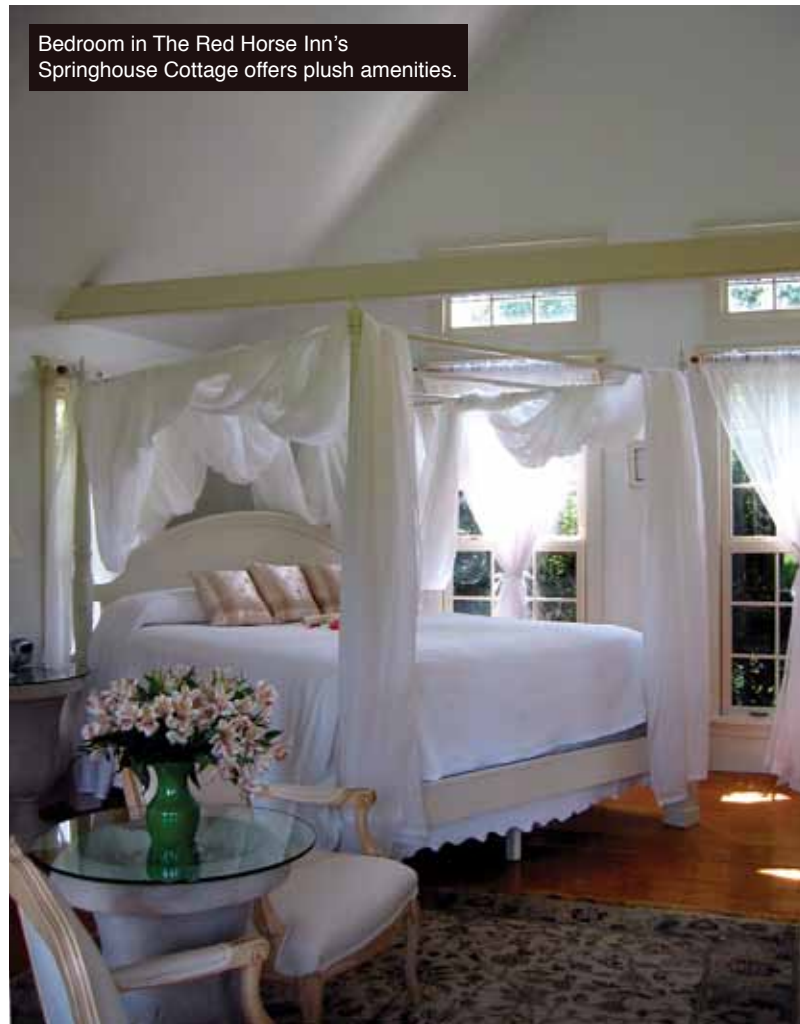
Bedroom in The Red Horse Inn's Springhouse Cottage offers plush amenities.

Also nearby is Spartanburg. Born during the Revolutionary War, you can experience its rich history in museums and battlefield tours. The charming town of Asheville, NC, about 45 miles north, attracted many notables in the 1920s including F. Scott Fitzgerald, Thomas Edison and Henry Ford. The famed 250-room Biltmore House and Thomas Wolfe Memorial, boyhood home of the acclaimed author, are among its many interesting sites.