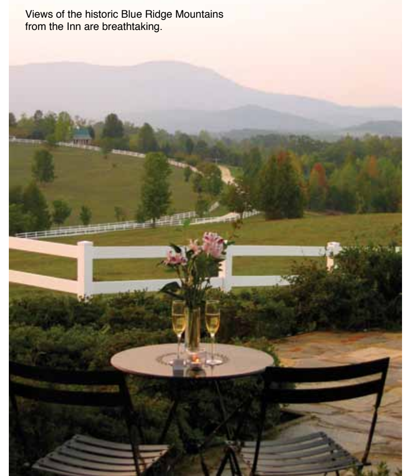
Views of the historic Blue Ridge Mountains from the Inn are breathtaking.

When you think of Cancun, mega-resorts generally come to mind. If you like the destination but prefer something more intimate, check out Esencia, a charming oceanfront boutique hotel with only 29 rooms. Originally the home of an Italian duchess who still visits upon occasion, it offers all the personalized service and amenities of a world-class resort with the privacy, luxury and personal touches expected in a residence.