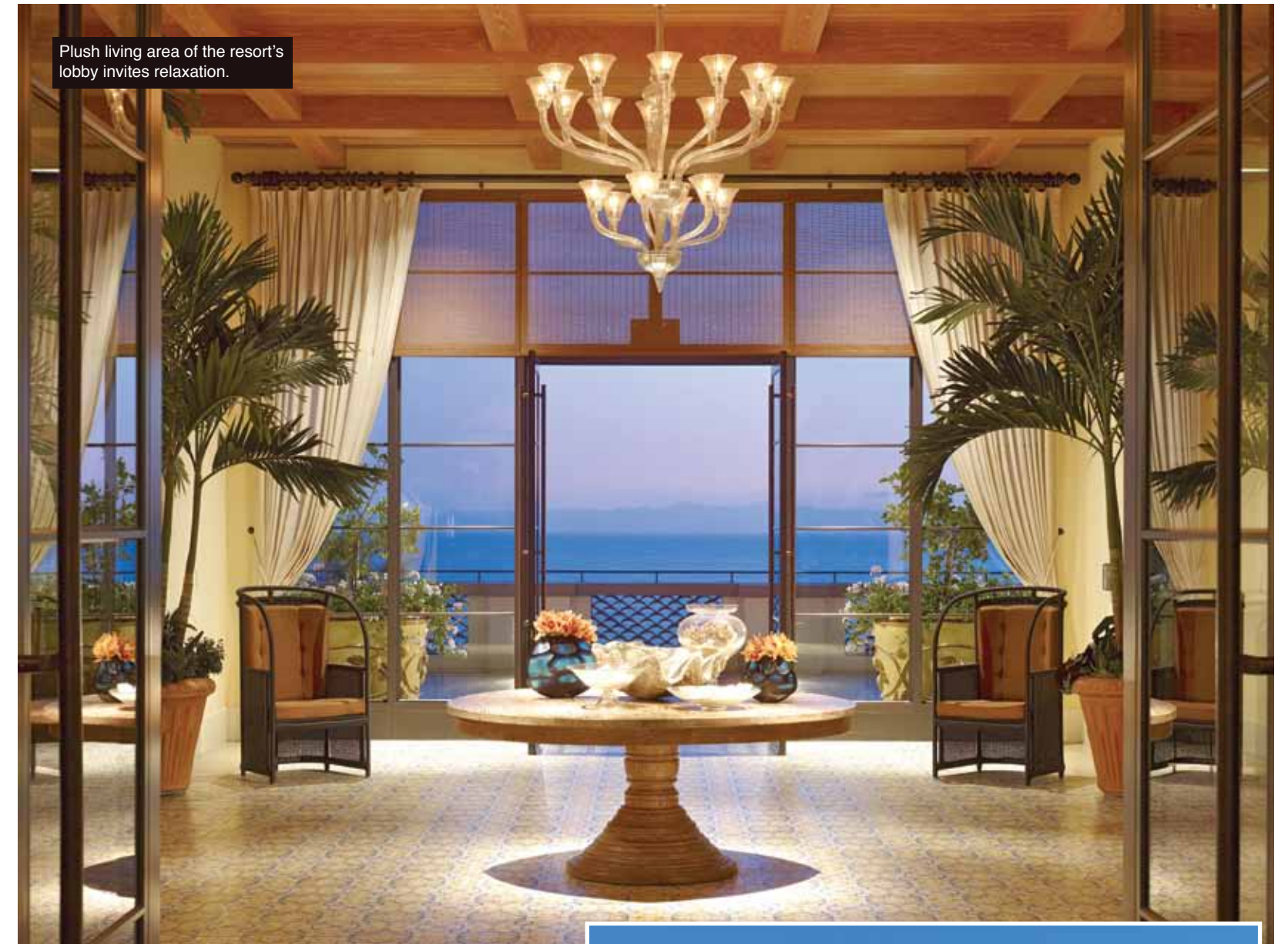
Plush living area of the resort's lobby invites relaxation.

The property's signature Sal Y Fuego (Salt & Fire) Restaurant offers sophisticated international cuisine with a Mexican flare served in a casual, refined setting. From fresh herbs and exotic