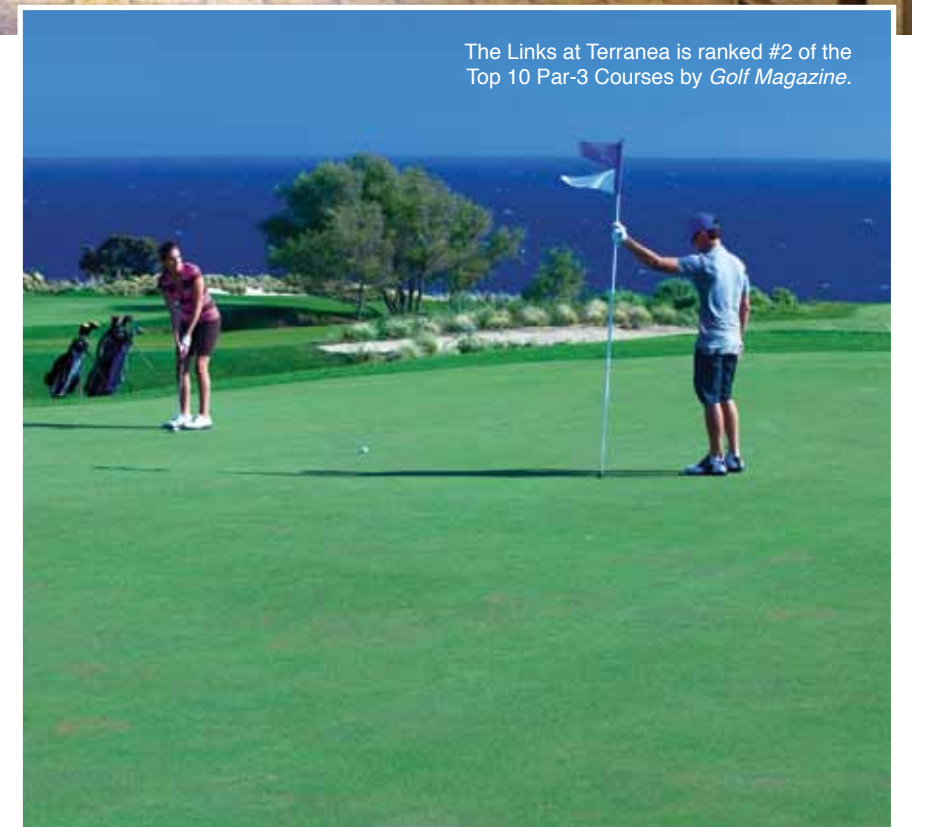
The Links at Terranea is ranked #2 of the Top 10 Par-3 Courses by Golf Magazine .

Wherever you choose to celebrate with your special someone, we wish you a very Happy Valentine's Day. ❖❖❖