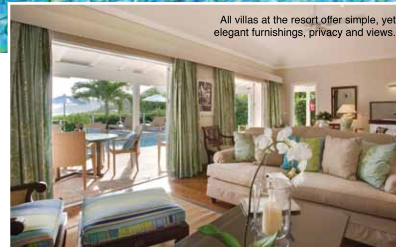
All villas at the resort offer simple, yet elegant furnishings, privacy and views.

jewelry stores. Some 80 dining spots offer everything from a quick snack to gourmet French, and people-watching from the terraces of waterfront cafés is a relaxing way to immerse yourselves in island ambiance.