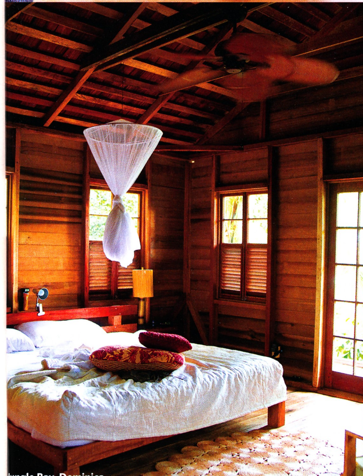
Jungle Bay, Dominica