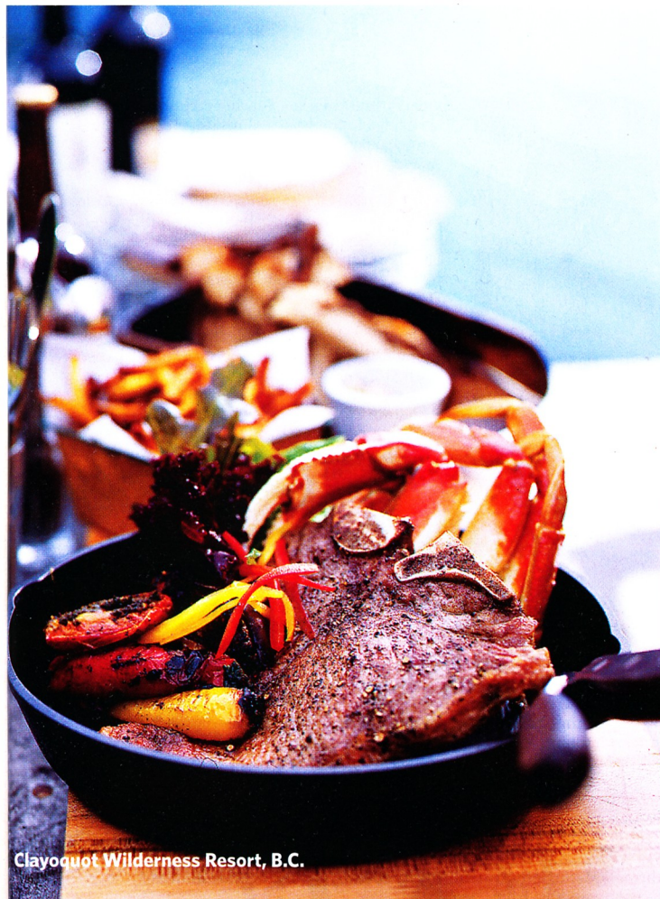
Clayoquot Wilderness Resort, B.C.