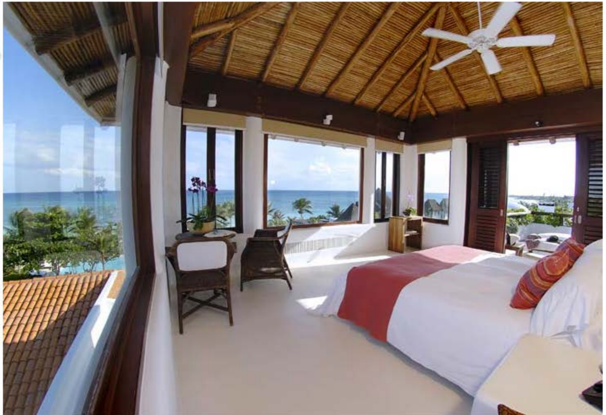
Mexico's Esencia resort in Riviera Maya mixes yoga and candlelit dinners. Nicel