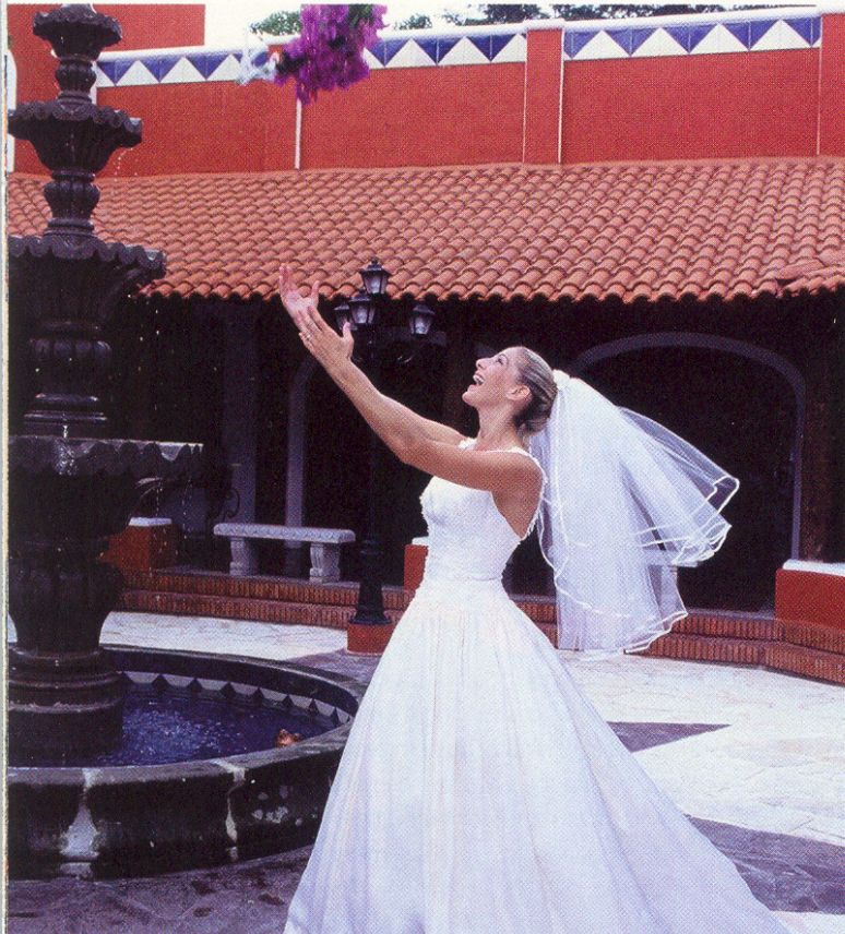
Occidental Hotels & Resorts offers wedding programs fit for a princess.

nighttime entertainment and dancing, and great activity programs ranging from dance classes to guided walks.